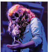
Kate Tempest.

Denise Riley's 'A Part Song' is an elegy or lamentation in different modes, written in response to the death of the poet's son. A sequence in twenty sections, it first appeared in the London Review of Books and publication was accompanied by a podcast of Riley reading the poem.