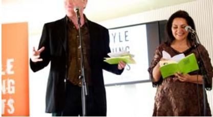
2011 Foyle Judges