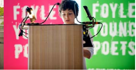
2011 Foyle Winner