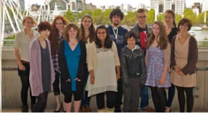
2011 Foyle Winners 2011